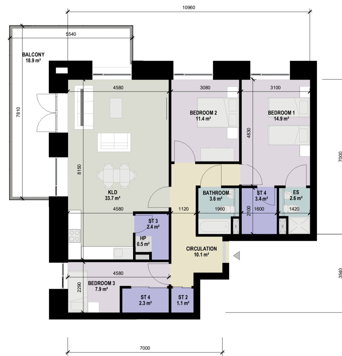
19 Level 01 - 3BedApt_5Per_Type2